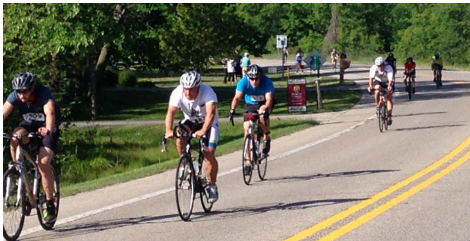
Good riding position is especially important during a race, as in the M-22 Challenge from a prior year.

REACH: This is the distance between the shoulders and the top brake levers when the cycle rider is sitting in the more upright position. The correctly set reach should allow the rider to sit an angle of around 45 degrees to the top tube of the cycle.